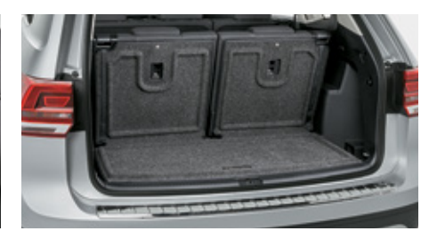
Heavy Duty Trunk Liner with Cargo Blocks and Extended Seat Back Cover

*MY2018 Atlas 6 years/72,000 miles (whichever occurs first) New Vehicle Limited Warranty. Based on manufacturers' published data on transferable Bumper-to-bumper/Basic warranty only. Not based on other separate warranties. See owner's literature or dealer for warranty limitations. **Tablet device not included.